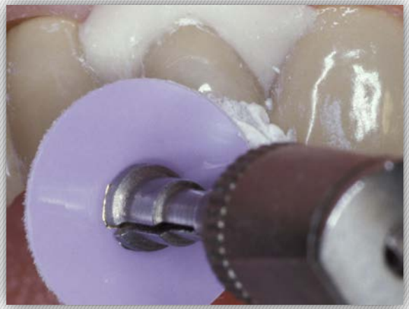
Enamelize polishing paste, applied with FlexiBuff