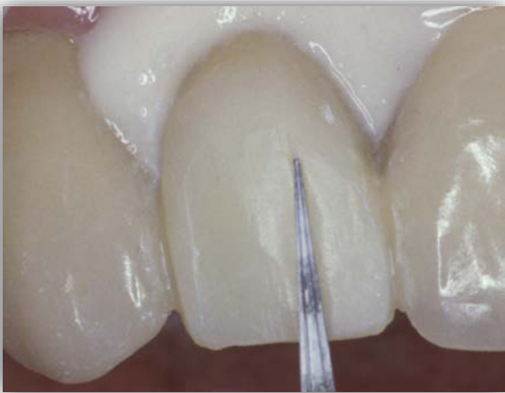
Contour using bur of choice