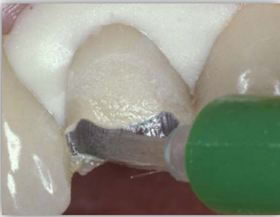
Silanator on porcelain for only 30 seconds