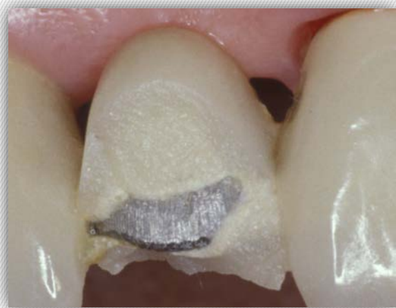
Porcelain fused to metal repair