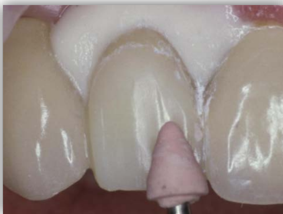
Characterization: Superfine FlexiPoint