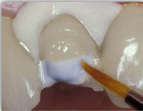
Application of Creative Color Pink Opaque, cure for 20 seconds