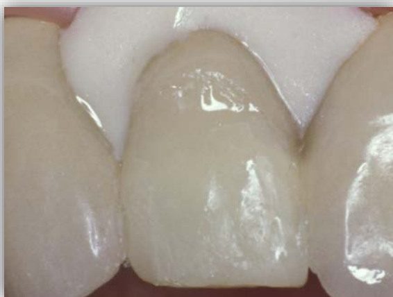
Renamel Microhybrid cured for 40 seconds. If slight grayness persists, apply additional opaque in the same shade as composite