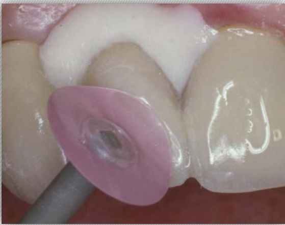
Polishing: Superfine FlexiDiscs