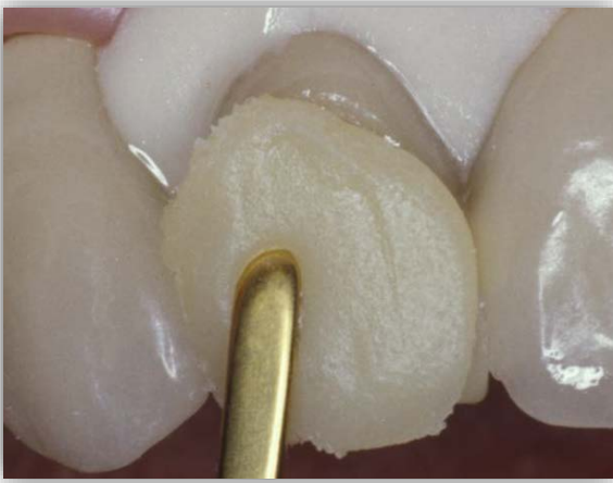
Application of Renamel Microfill same shade as Renamel Microhybrid