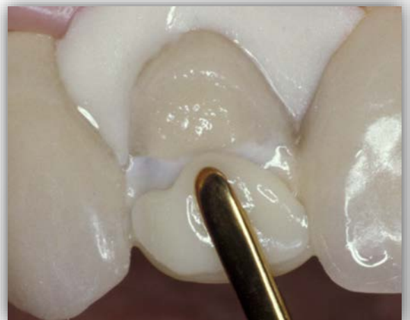
Application of Renamel Microhybrid