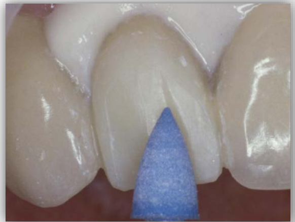
Characterization : Medium FlexiPoint