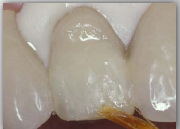
Application of Creative Color Grey tint to create translucence, cure for 20 seconds