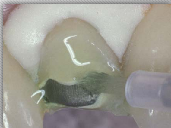
Cosmedent Clear PorcelEtch on porcelain for 4 minutes. Rinse with copious amounts of water