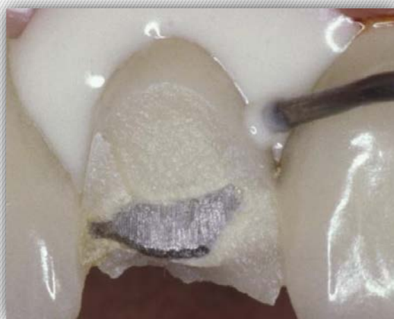
Application of GINGA-Guard™ light cured resin dam