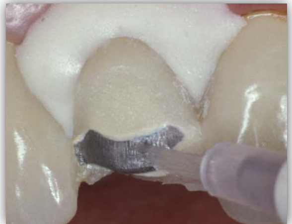
Complete Primer/Unfilled Resin on both porcelain and metal, cure for 20 seconds