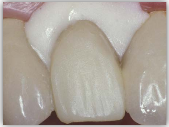
Renamel Microfill after 60 second cure