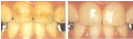
Is it real, or is it Renamel?

Renamel Microfill is so lifelike that it resembles tooth structure more than any other material, combining beauty with one of the strongest anterior microfills available in the market today. With Renamel Microfill you will get results that will astound both you and the patient. Results so natural it is often difficult to determine which tooth is real, which tooth is resin.