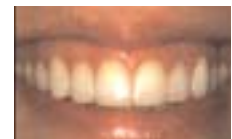
8 years post op.