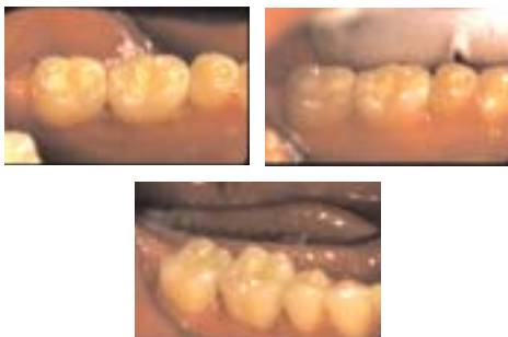
Polished Renamel Hybrid Restoration.

Renamel Hybrid can be polished almost to the luster of a microfill when utilizing the proper polishing system. Renamel Hybrid's small particle size of 0.7 microns gives you a smooth surface finish and a restoration that can be polished to a high degree of enamel-like luster.