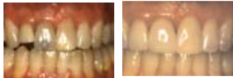
Solving multiple problems with Renamel Microfill, Renamel Hybrid and Creative Color.

all comfortable using. Renamel resins have been matched to them for 11 years more accurately than any other material in the marketplace. There are 16 different shades in the Vita shade guide encompassing four shade ranges. Cosmedent has also developed some useful new shades such as an extra light shade of Light Opaque, a new White for bleached teeth, and some extremely dark shades, A5, A6 and C5 which we felt were needed to complete the system.