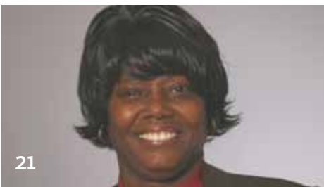
What a difference a new smile can make!