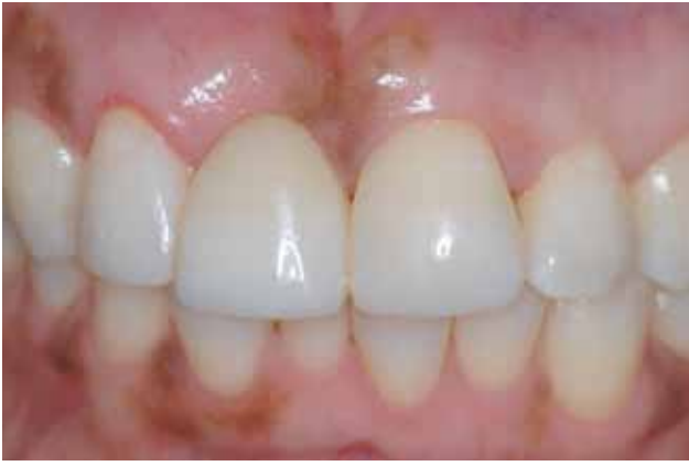
Figure 5: One year after treatment.