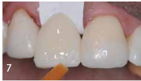
7 Smoothing flowable Renamel Microfill with Cosmedent #3 brush.