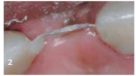
2 Ribbon cemented in place with Insure resin cement (Cosmedent) and overlaid with Renamel Nano (Cosmedent).