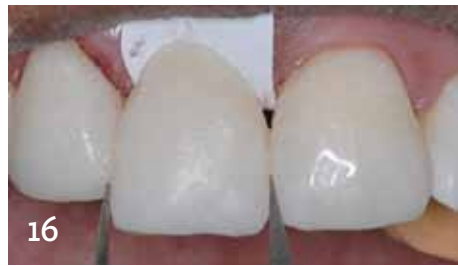
Symmetry is accomplished in the "eyes" of the dentist. Angulation and inclination have to be done by "eye-balling" it.