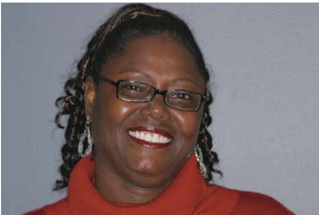
Figure 6: One year after treatment—a very happy patient!

I placed a thin moist cotton pellet on the adjacent tooth to keep it from desiccating, a great trick to help determine correct tooth color. Because the cotton pellet keeps the tooth moist it is easier to see the perfect color throughout the procedure. I added a little more tint to the gingival surface of the pontic in an attempt to create a perfect match.