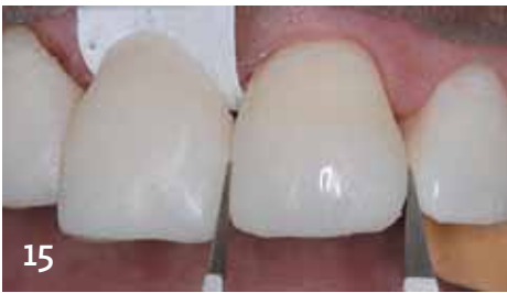
Prior to finishing, measurements were taken from the mesial of the lateral incisor to lateral incisor with a digital boley gauge and then divided by two, to determine the total width of space needed for both central incisors.