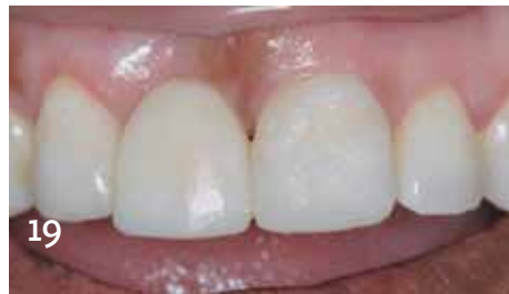
Notice moist cotton pellet on adjacent central to prevent dessication to achieve perfect color match.