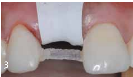
3 Teflon tape was placed over the gingival tissue to aid in the creation of a smooth gingival surface for the pontic.