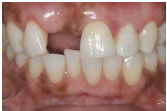
Figure 3: Pre-treatment, retracted view.