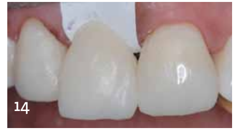
This technique of sculpting greatly simplifies the final technique of contouring, finishing, and polishing.