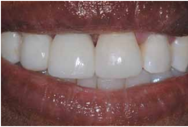
Figure 4: Postoperative evaluation confirmed that the gingival chroma needed to be enhanced.