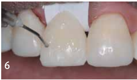
6 Addition of small amount of flowable Renamel Microfill.