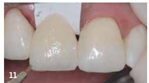
11 Gray tint was added to the incisal third.