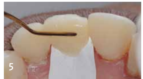
5 Application and sculpting of lingual surface with nano-fill.