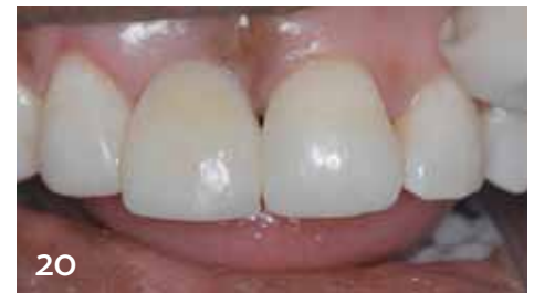
More gingival tint was added to the cervical third prior to final microfill; notice the increased chroma.