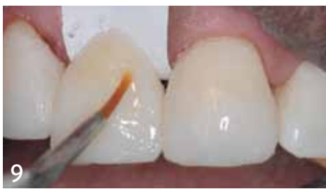
9 Creation of cervical chroma.