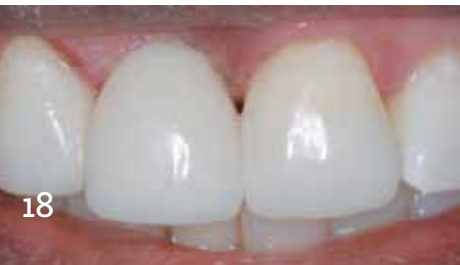
Polishing completed; notice lack of gingival chroma.