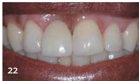
Finished case, immediately postoperative.