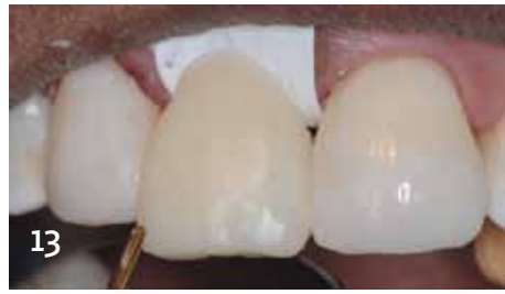
Great attention was given to the proper formation of line angles and embrasures.