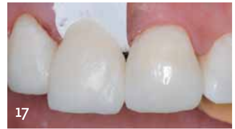
Completed restoration prior to polishing.