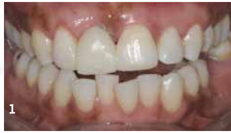
1 After the mock-up.