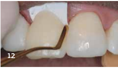
To create the enamel surface, Renamel Microfill was placed and sculpted to the exact proximal contour while at the same time slightly over-contouring from the facial.