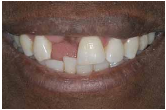
Figure 2: Pre-treatment, natural smile view showing damage from abuse.