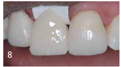
8 Polymerized flowable creating the artist's canvas.