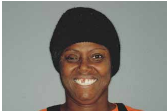
Figure 1: Pre-treatment, full-face image of patient. Notice semi-closed right eye.

At the next appointment, I reduced the microfill layer slightly all the way to the middle third of the tooth.