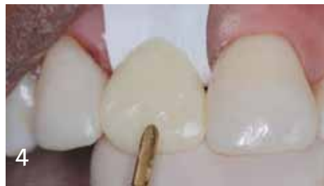
4 Application of nano-fill composite over the Ribbon to form the dentin layer of the tooth surface.